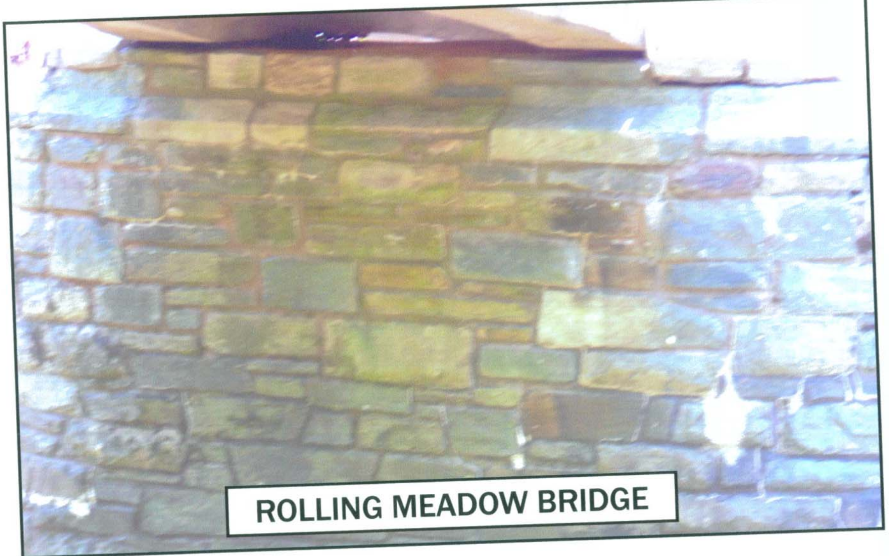
ROLLING MEADOW BRIDGE