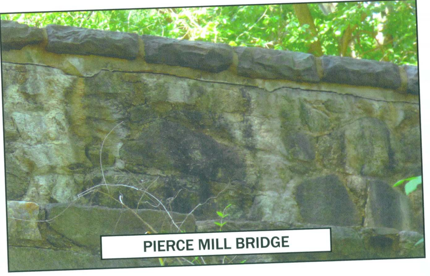
PIERCE MILL BRIDGE