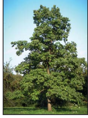
KENTUCKY COFFEE TREE Gymnocladus dioica 'Stately Manor'

Height..... 35'-0" to 60'-0" Spread..... 25'-0" to 35'-0" Bloom Color ..... White, Yellow Bloom Period ..... May to June