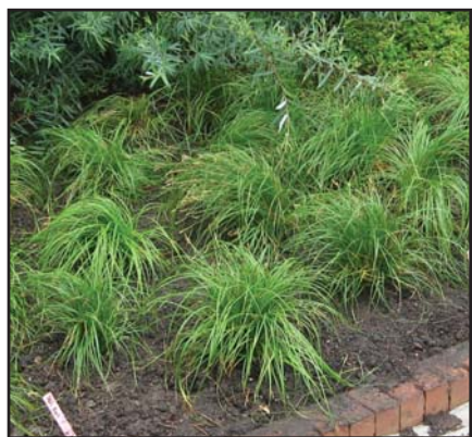
NORTHERN SEA OATS Chasmanthum latifolium

Height..... 0'-6" to 1'-0" Spread..... 0'-6" to 1'-0" Bloom Color ..... Green Bloom Period ..... May