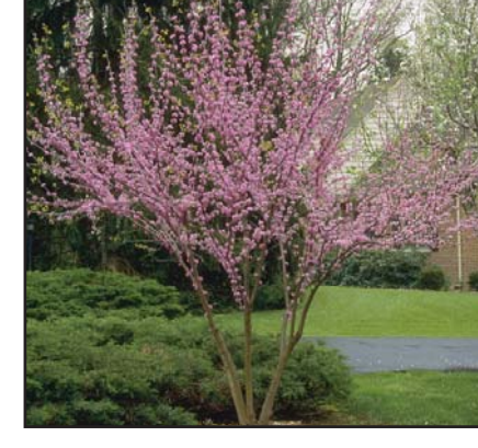
APPLE SERVICEBERRY Amelanchier x grandiflora 'Autumn Brilliance'

Height..... 20'-0" to 30'-0" Spread..... 25'-0" to 35'-0" Bloom Color ..... Red-Purple, Rosy Pink Bloom Period ..... March to April