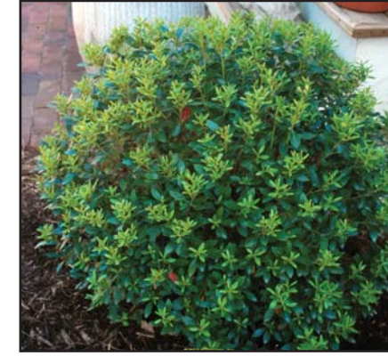
VIRGINIA SWEETSPIRE Itea virginica 'Henry's Garnet'

Height..... 3'-0" to 4'-0" Spread..... 4'-0" to 6'-0" Bloom Color ..... White Bloom Period ..... May to June