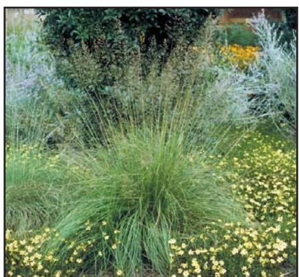
SWITCHGRASS Panicum virgatum 'Ruby Ribbons'

Height..... 2'-0" to 3'-0" Spread..... 2'-0" to 3'-0" Bloom Color ..... Pink Bloom Period ..... August to October